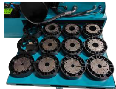
Clamper Die : 17 PCS