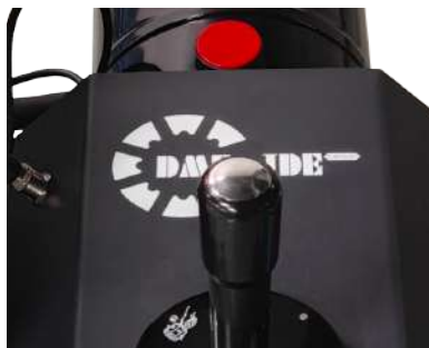
Dies&Mold Base – Strong Magnetic